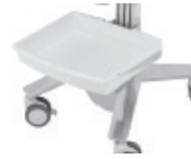
SV Sani-wipes Holder