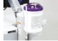
SV Wire Basket, Large