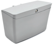
SV Storage Bin