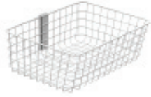
Several drawer configurations