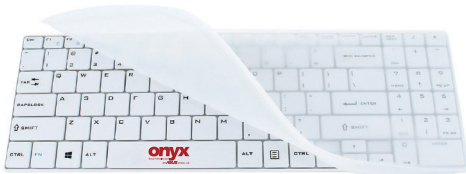
CleanWipe Cover Included (Latex-Free)